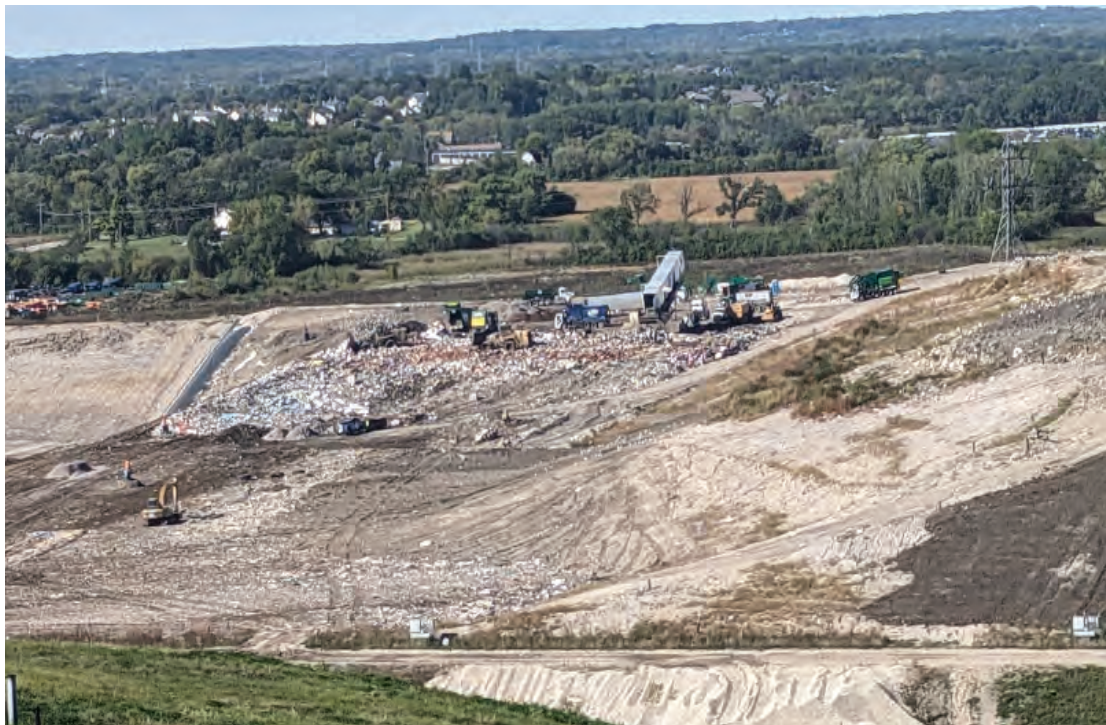
Current cover of Phase 3