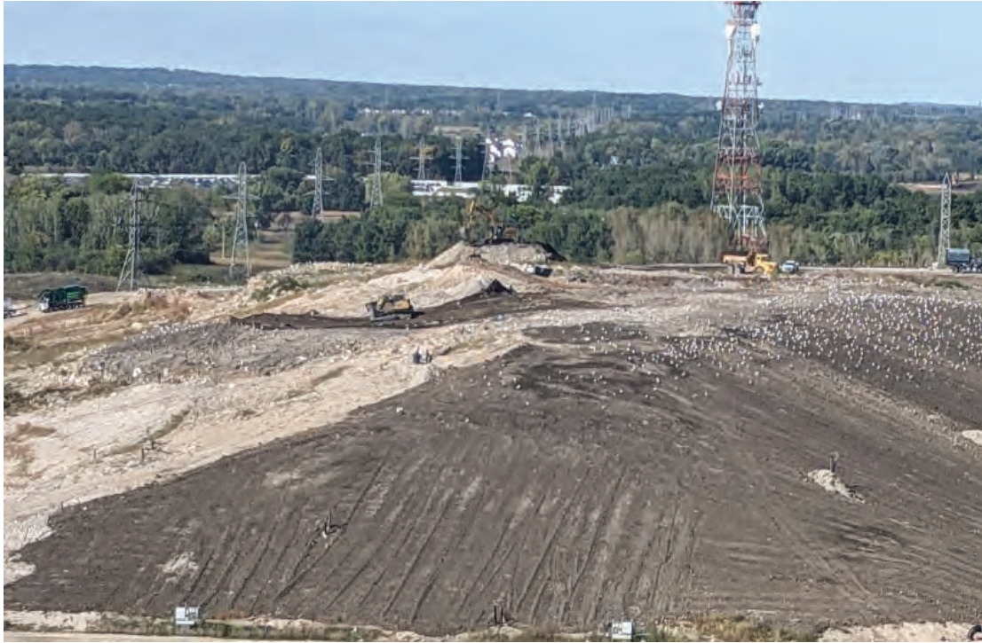
Phase 1 & 2 slopes with top soil