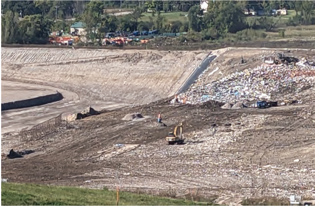
Phase 3 , Southern portion well covered, lift and working face at North end