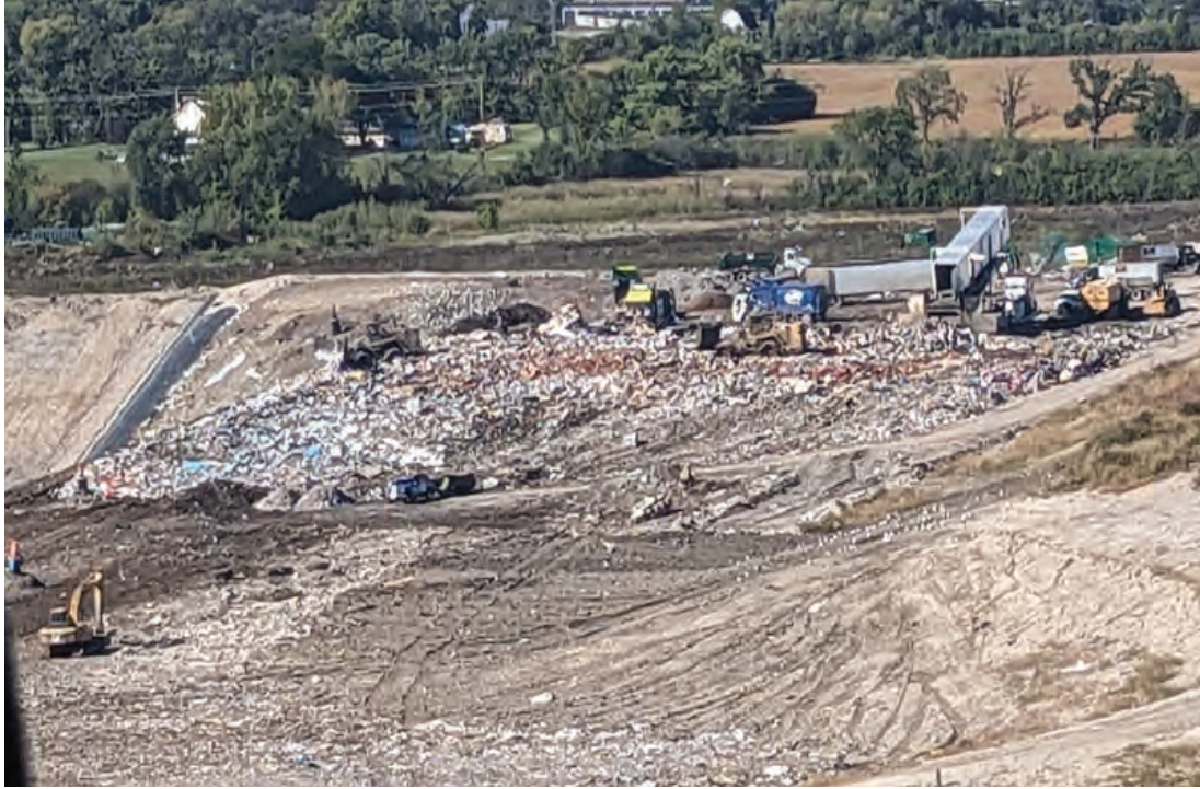
Working face, about 2 lifts deep at North end of Phase 3, overlaid on Phase 2