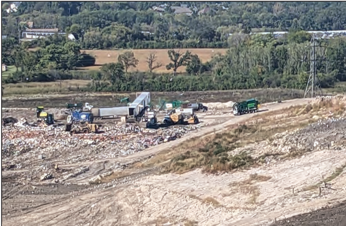
Working face, about 2 lifts deep at North end of Phase 3, overlaid on Phase 2