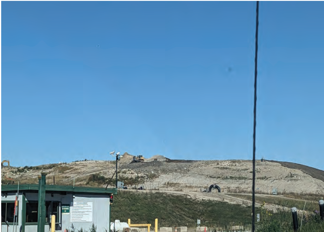
Phase 3 still below grade